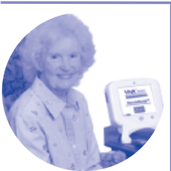
The easy-to-use telehealth unit supplements traditional nursing care.

VNA Care Network & Hospice recently unveiled new telehealth equipment to help patients with chronic illness continue living at home.