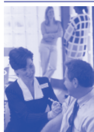
VNA Care Network & Hospice offers flu vaccination clinics.